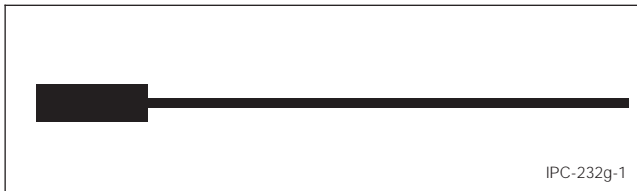
Figure 1 Chemical Resistance Test Pattern

3.1 Method A - Metal-Clad Dielectric The test specimen shall consist of a size commensurate with the peel strength test fixture and have an etched conductor pattern in accordance with Figure 1.